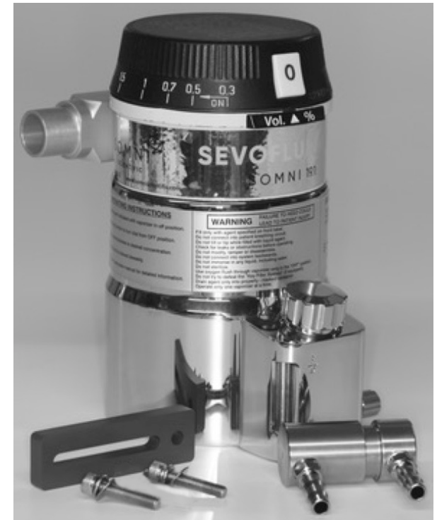
Vaporizer Spacer placement

Complete a 10 second pressure test to confirm a leak free installation. See next page